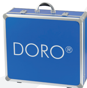
DORO® Storage Case Headrest System (optionally available) Item no. 1001.030