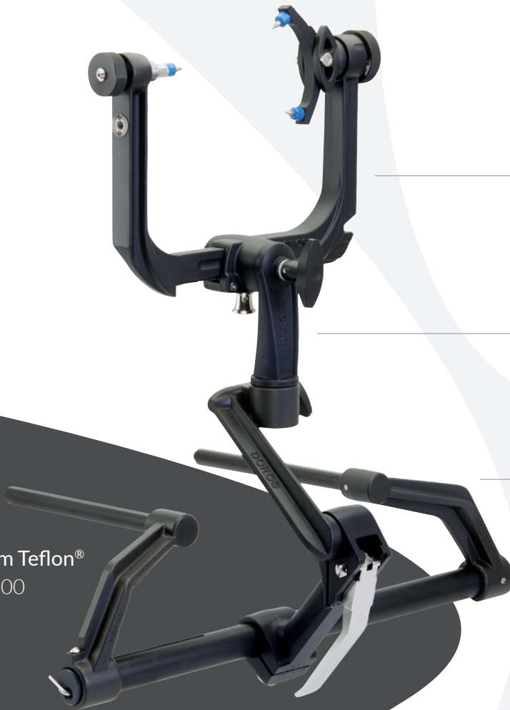
DORO® QR3 Headrest System Teflon® Item no. 3003-100