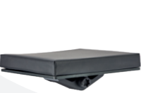
DORO LUCENT® Headplate Item no. 4003.005

With the first installation of a DORO LUCENT® iMRI Headrest System, an expert training is mandatory. Please contact your local DORO® representative for details.