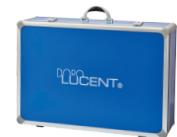
DORO LUCENT® Storage Case for Parallelogram Adaptors Item no. 4003.030