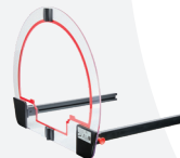
DORO LUCENT® iMRI Transfer Collision Indicator Item no. 4003.XXX